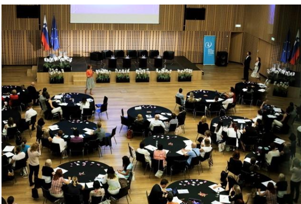
Closing Event (Slovenia)